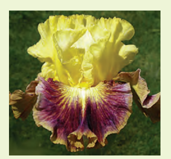
I. germanica 'Static Electricity'