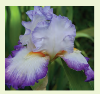
I. germanica 'Conjuration'