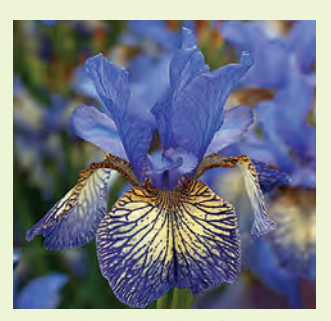
I. sibirica 'Banish Misfortune'