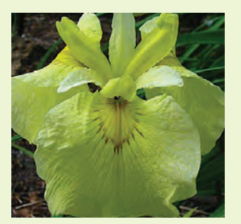
I. xpseudata 'Aichi no Kagayaki'