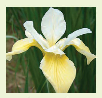
I. sibirica 'Butter and Sugar'