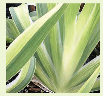
I. tectorum 'Ikeda Sunbeam'