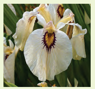
I. ×pseudata 'Okagami'