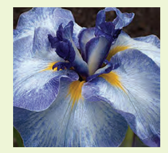
I. ensata 'Cascade Crest'