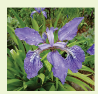
I. tectorum 'Wolong'