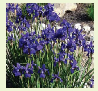
I. sibirica 'Caesar's Brother'