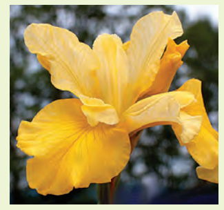
I. sibirica 'Kiss the Girl'