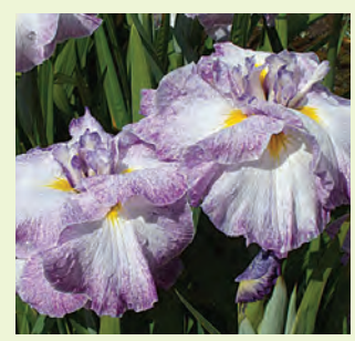
I. ensata 'Picotee Princess'