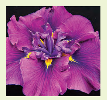
I. ensata 'Japanese Plum'