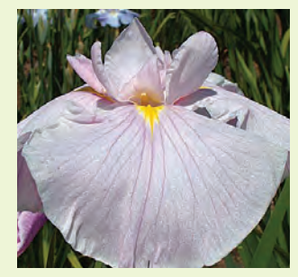
I. ensata 'Little Bow Pink'