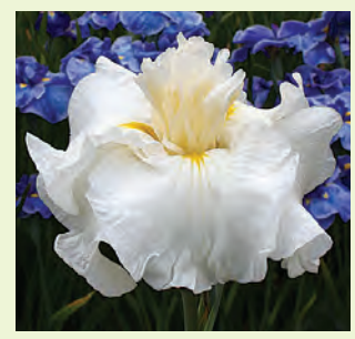
I. ensata 'Angelic Choir'

Iris ensata 'Picotee Princess' Japanese Iris 3–4 ○ © © 1 g $1 Mid season—late; ruffled white, sanded violet blue, darker edges, signal yellow; Payne Award.