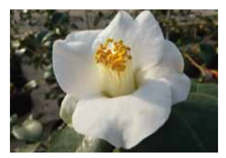
Spring blooming Camellia japonica 'Korean Snow'.