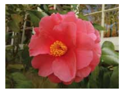
Spring blooming Camellia japonica 'Kumasaka'.

Hybridizers combined the hardiness of this white fall-blooming species from China with the floral attributes of traditional