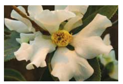
Tender Camellia yuhsinenesis.