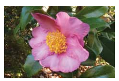
Fall blooming Camellia 'Winter Star'.