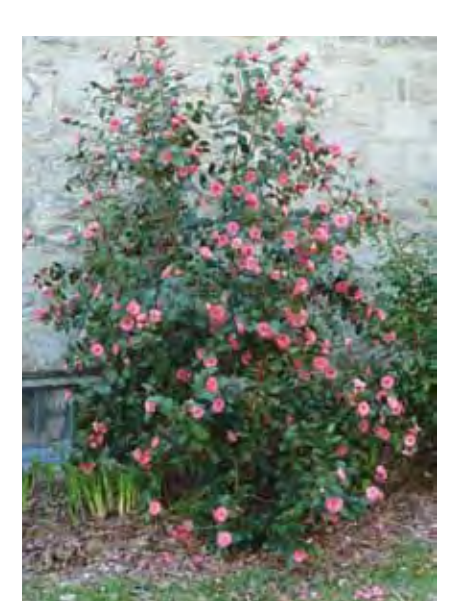
Camellia japonica 'April Kiss' blooms peak in April.

1. The spring blooming varieties begin as early as March and continue until late April or early May. Individual varieties have an earlier or later period of bloom, but the peak season is April. This is the classic camellia with many cultivars derived from Camellia japonica and its hybrids. Flowers may exceed 4 inches in diameter in colors ranging from pure white through shades of pink to dark red. Flower forms vary from single